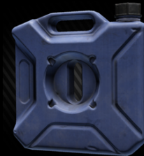
10KG / 2.5KG Packaging (sample photo)

1 KG LYSOZYME SOLUTION + 100 KG WATER = 100 KG DISINFECTION WATER