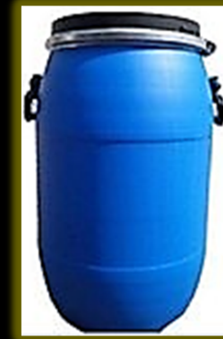
Normal Water Tank Solution mix with 100 x water by yourself

1 KG LYSOZYME SOLUTION + 100 KG WATER = 100 KG DISINFECTION WATER